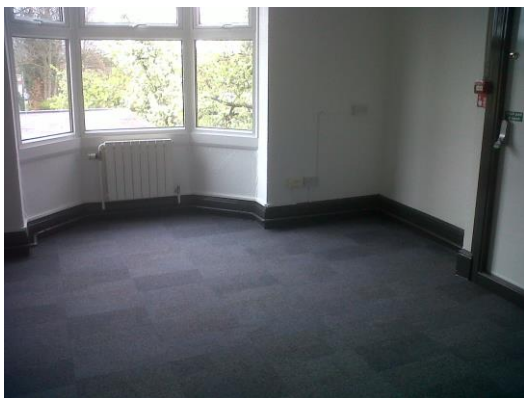
First Floor Rear Office