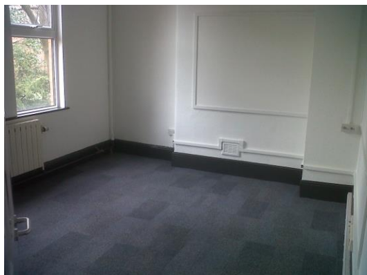
First Floor Front Office