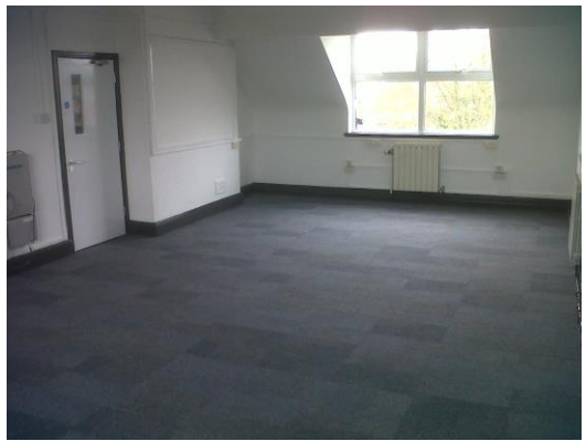
Second Floor Office