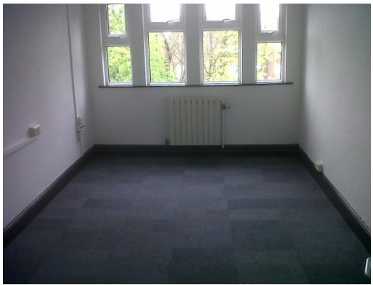
Second Floor Front Office